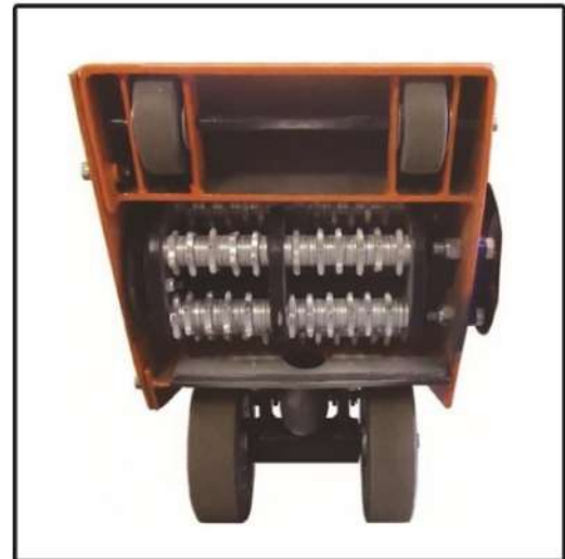
Available with Tungsten Cutters

Designs and specifications subject to change without notice or obligations. Exact weights are dependent upon power source.