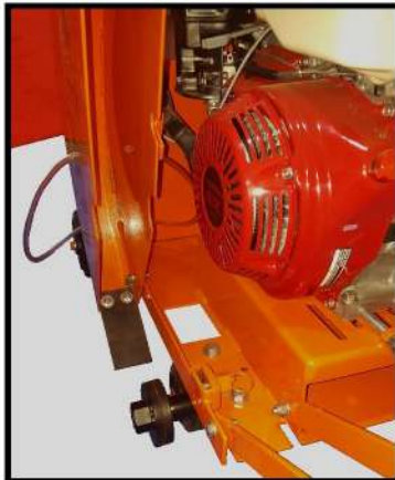
Hinged guard with easy lock for arbor replacemnet